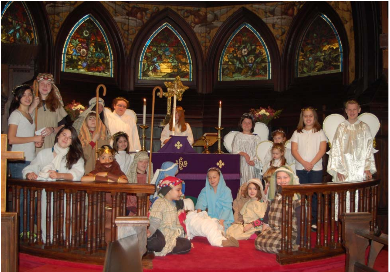
Photograph of children from St. Paul's Church School who participated in the 2010 Christmas Pageant.